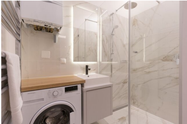
Badezimmer - Waschmaschine