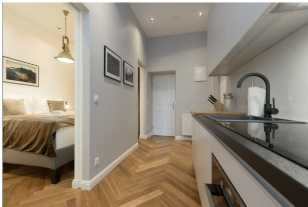
Küche - Schlafzimmer